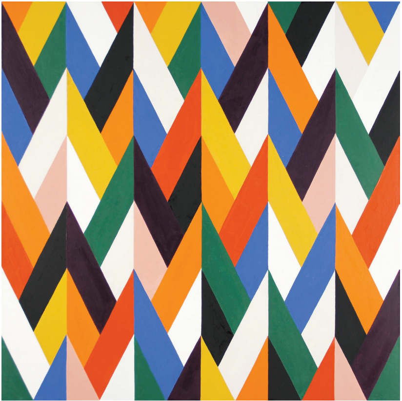
Djinn , 2013, 24 x 24 inches, oil and alkyd on canvas