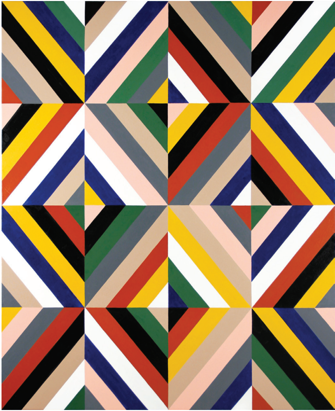
Rosewood, 2013, 41 3 / 4 x 34 inches, oil and alkyd on canvas