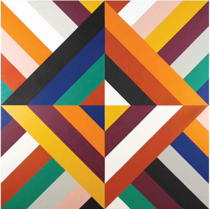
Otherwise , 2013, 48 x 48 inches, oil and alkyd on canvas