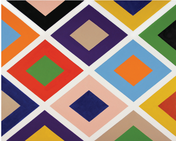
Dindi, 2013, 24 x 30 inches, oil and alkyd on canvas