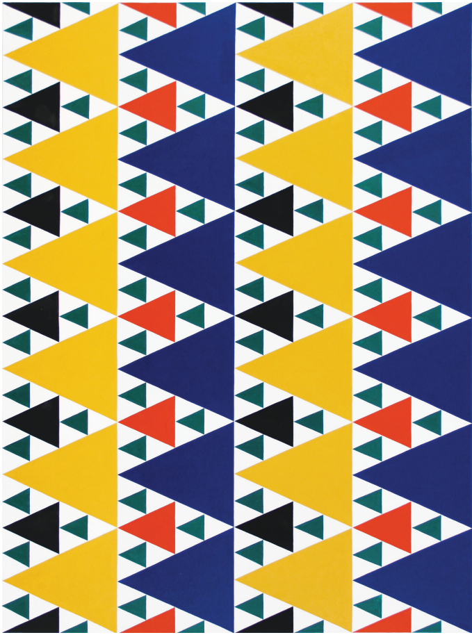
High Plains , 2012, 48 x 36 inches, oil and alkyd on canvas