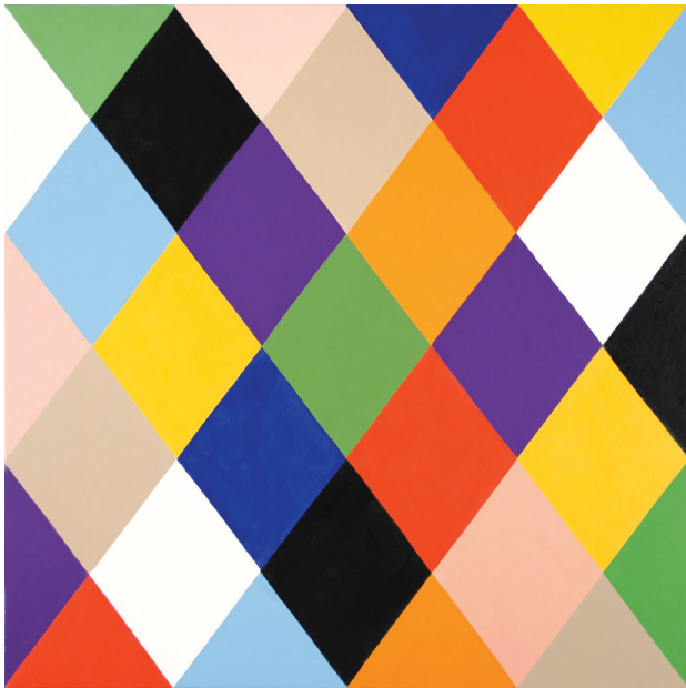
Persimmons, 2013, 24 x 24 inches, oil on canvas