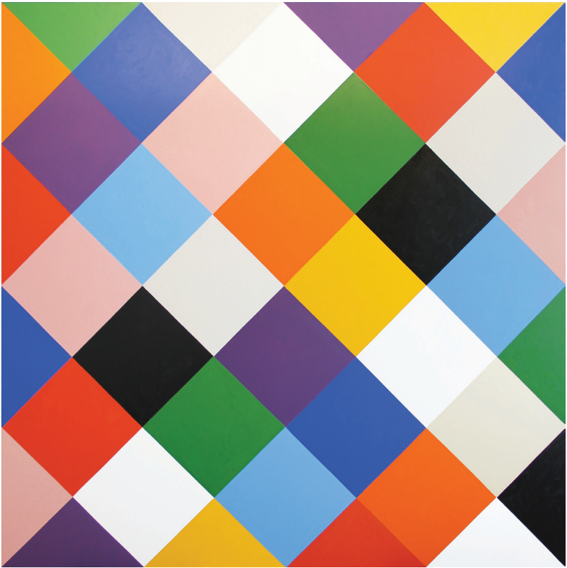
Time Tells Us What to Do, 2013, 72 x 72 inches, oil and alkyd on canvas