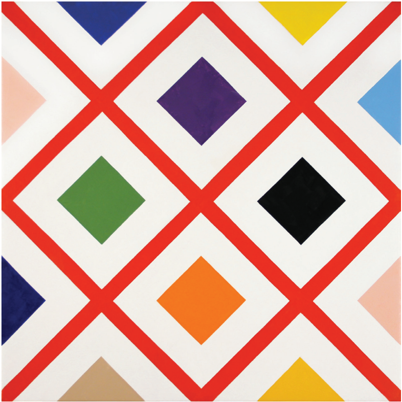
Favorable Conditions , 2013, 26 x 26 inches, oil and alkyd on canvas