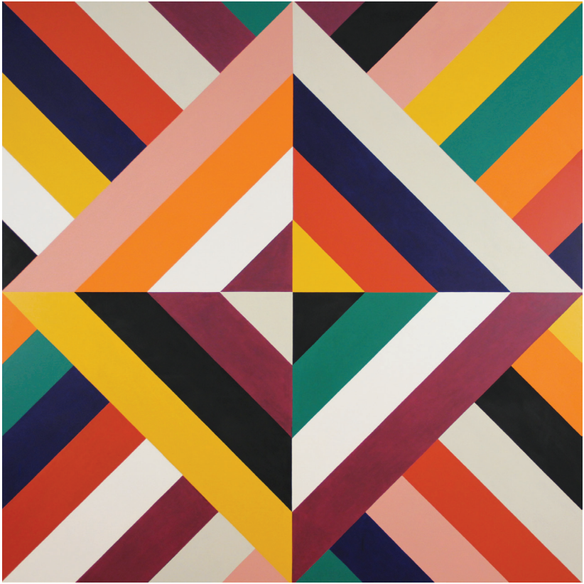
Magnolia, 2011, 72 x 72 inches, oil and alkyd on canvas