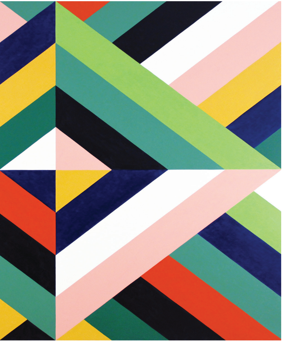
Nature Boy , 2012, 60 x 80 inches, oil and alkyd on canvas