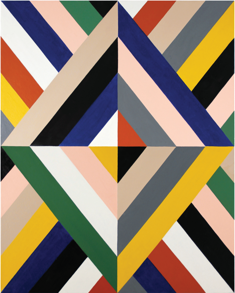
Sandalwood , 2013, 30 x 24 inches, oil and alkyd on canvas