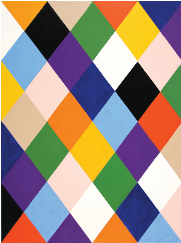
Cherbourg, 2013, 24 x 18 inches, oil and alkyd on canvas