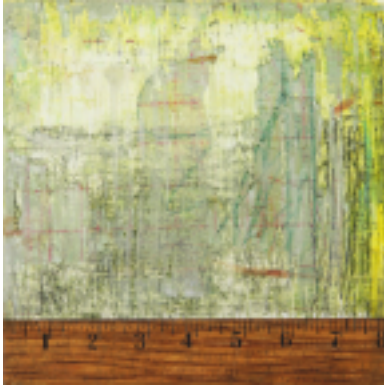
Maine Notes 41, 2016

Gallery in Tribeca. The prevalence of interest in figuration and narrative in relation to abstraction in painting led to his inclusion in numerous group shows during the 1980s.