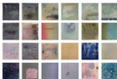
The Hours , 2014

Opening reception Thursday, November 3, 8, 6 – 8 pm