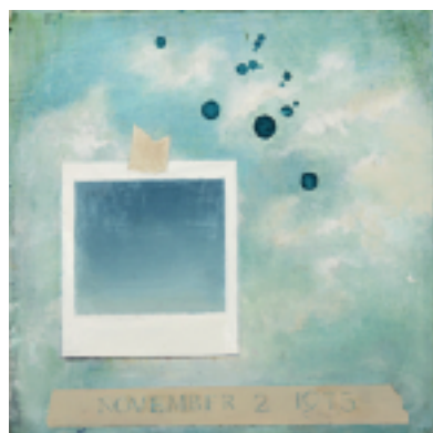
Maine Notes 39 , 2016